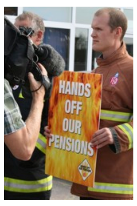
Media reporting Bridgwater