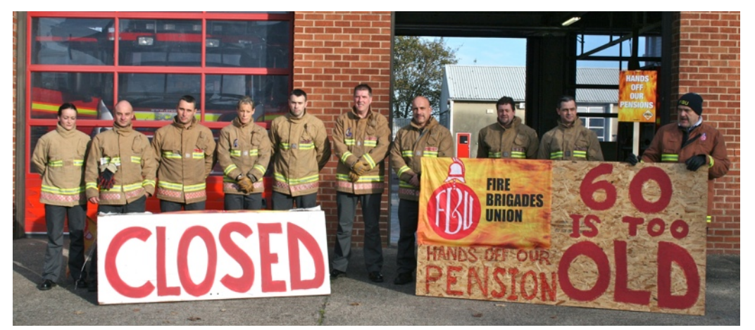
Fire Crews at Speedwell Fire Station in Avon get the message across!

Firefighters across England and Wales took their fourth period of strike action between 10am and 2pm on Wednesday 13th November over Government plans to tear up their pensions and force through a set of proposals which have been described as "unfair, unsustainable and unsafe."