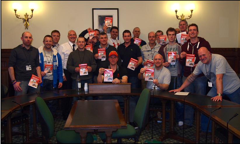
FBU Members in Parliament