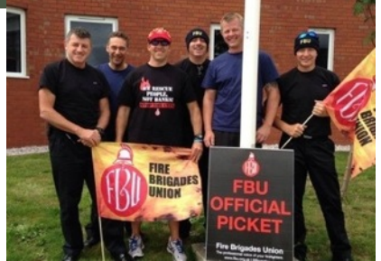
Temple Yeovil Danes Castle